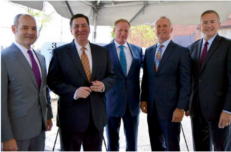
The GPCC joined City of Pittsburgh Mayor Bill Peduto to announce the new Burns White headquarters in Oxford Development's 3 Crossings mixed-use development in Pittsburgh's Strip District.