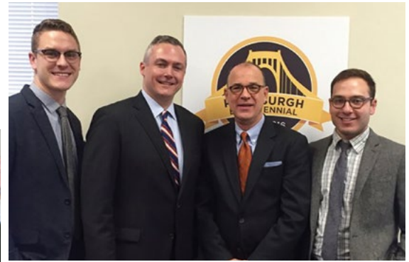
The GPCC holds quarterly meetings with members of Pittsburgh City Council. These forums, such as our recent discussion with Council President Bruce Kraus, provide opportunities to collaborate on shared issues of regional importance.